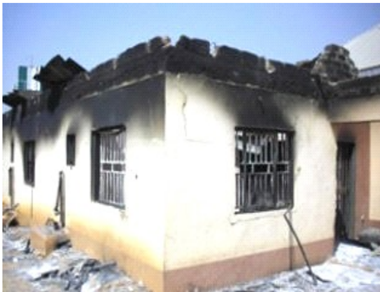
Pastor's house burned by Fulani militant in Jos Nigeria 2010

The blast occurred very close to Nyanya where a local pastor and his church members