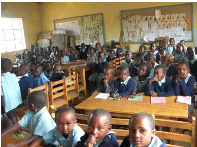
90 children in a class