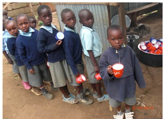
Daily porridge and lunch provided